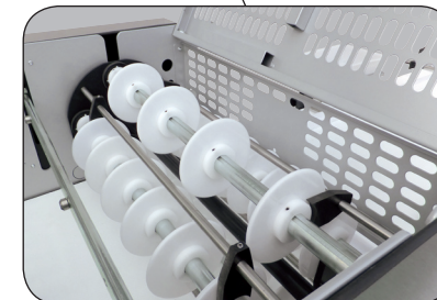
Longitudinal cutting disks and Transversal cut guillotine