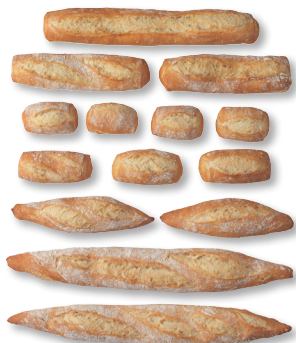
Types of bread