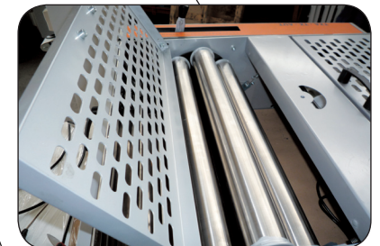
Adjustable laminate-spread multiroller system