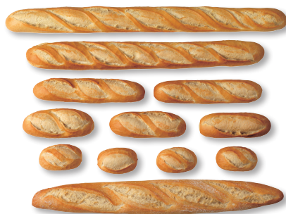
Types of bread